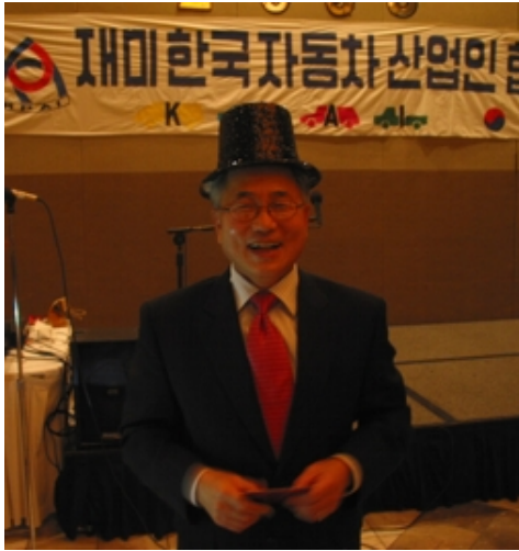
Best male dresser