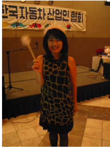
Best female dresser