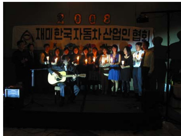
Staff prepared special Christmas Carols.