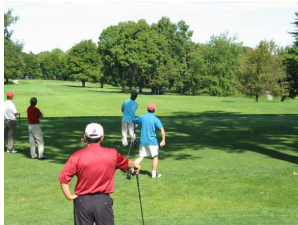
A scene from the Annual Golf Outing: Where did it land?